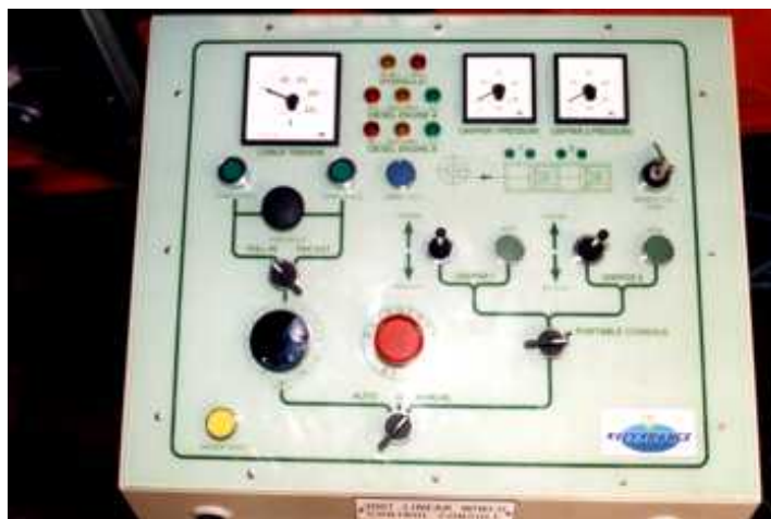
Remote Control Console.

For all the machines provided, KLEY FRANCE designs and manufactures the corresponding power pack, driven by a remote control console.