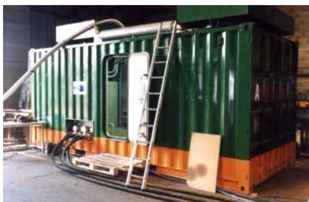
Power Container 20'.